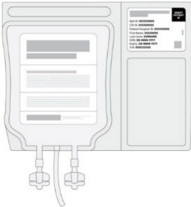
Figure 2: Patient Specific Identifiers

Patient Specific Identifiers: Apheresis ID Chain Of Identity ID Patient Hospital ID Patient Name Patient Date of Birth